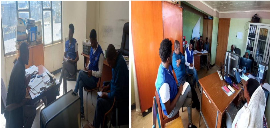
Fig 1.Meeting with woreda and zonal cluster leaders @ Maichew town

regional and national coordination meetings held in Mekele and Addis Abeba. The RRF team encouraged NMWEO to consult with and deliver a monthly report for the National cluster via report hub.