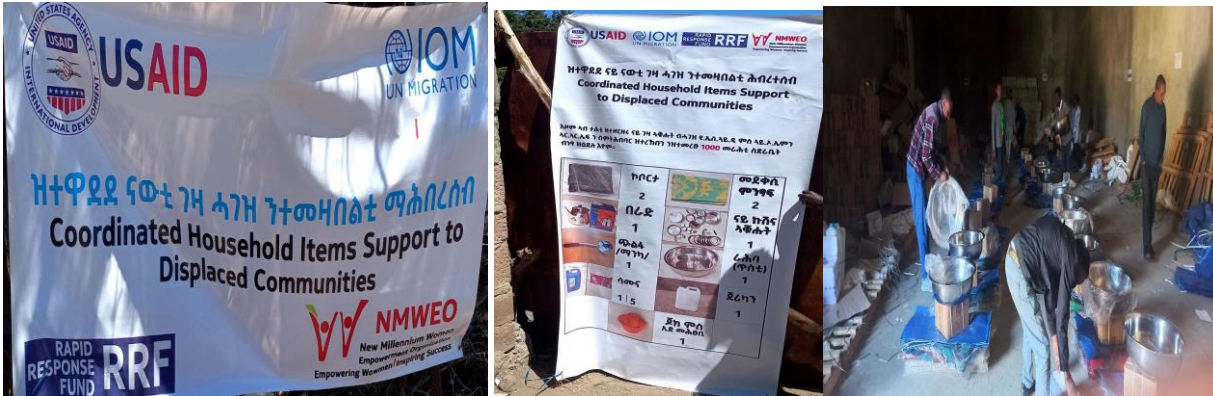
Fig. Information disseminating banners at public place