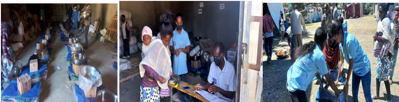
Fig. Community volunteers arranging NFI before distribution.