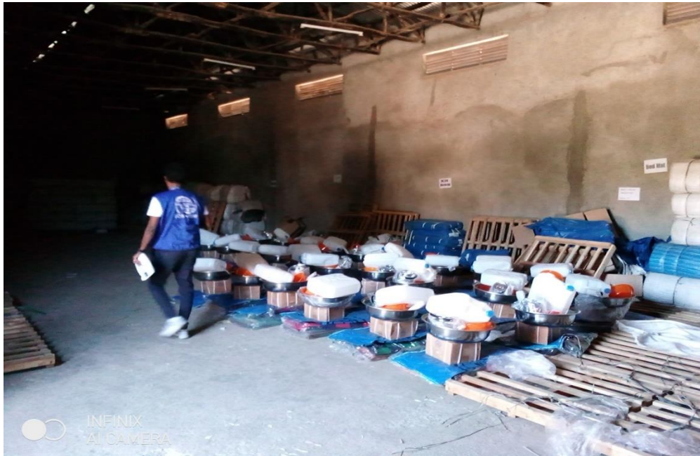
Picture 3: Arrangement of items in the warehouse, kitted for distribution.