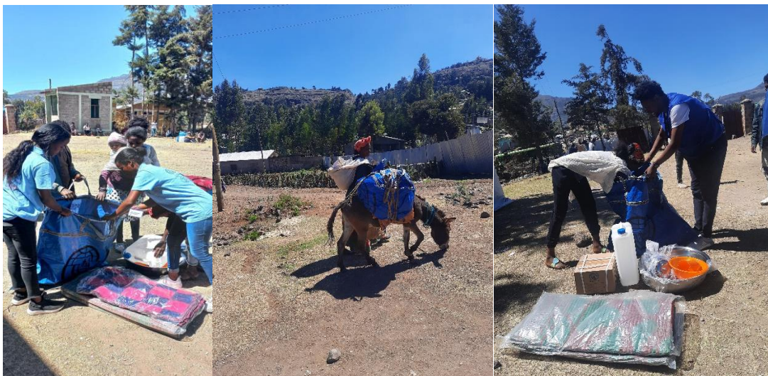
Fig. Community volunteers assisting IDPs at distribution sites(left), women using donkey back for taking the NFIs home(middle), IOM/RRF staff helping a women pack her NFIs (right)